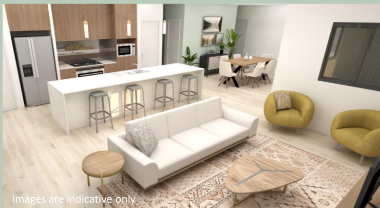
Images are indicative only